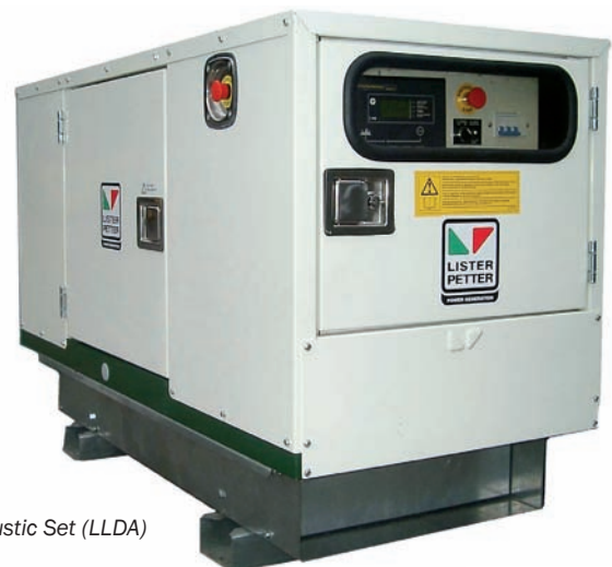
Acoustic Set (LLDA)