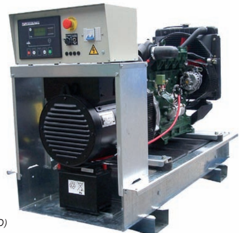
Open Set (LLD)